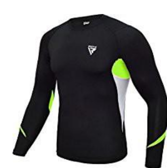
Colour pattern showing NOT ACCEPTABLE