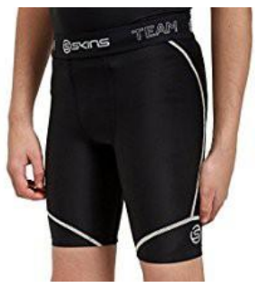
Colour pattern showing NOT ACCEPTABLE IF SHOWING UNDER SHORTS